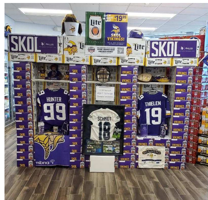
St. Francis Liquor, Lite +10.5%